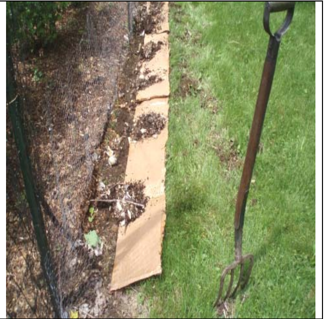
Mycelium in place