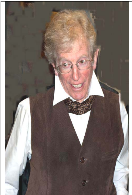
Sir Charles Darwin as he appeared at the COMA program, May 19, 2009

Sir Charles appeared to enjoy his brief visit with our COMA members and was surprised and pleased to hear that everything he had ever written was available to us at www.DarwinonLine.com . To learn more about Sir Charles and his discoveries, this would be an excellent place to start.