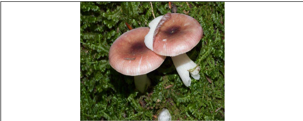
Russula emetica