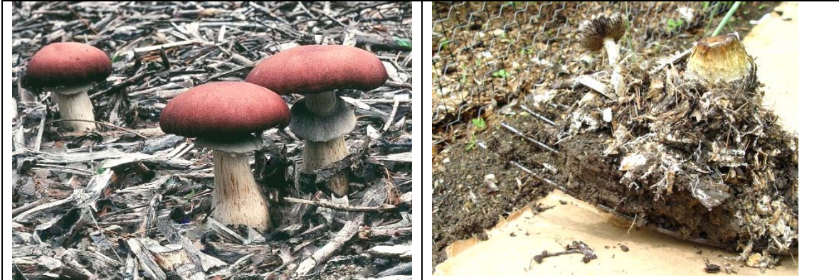
Fruiting Stropharia rugosoannulata