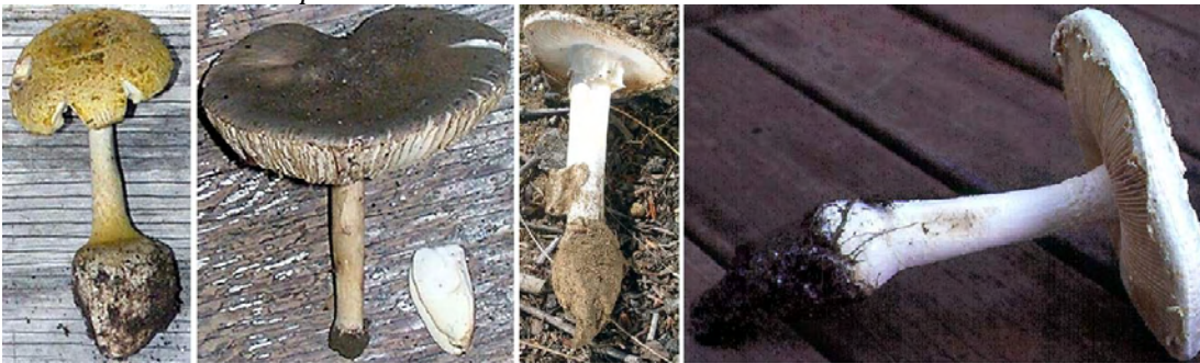
Fig. 1. Unusual amanitas from 2007-09 Clark T. Rogerson forays (left to right): An undescribed species of sect. Amanita similar to A. siamensis and A. levistriata , A. recutita sensu Coker, A. cylindrispora , and A. subsolitaria .

I think the discovery of material of A. subsolitaria (Murrill) Murrill in 2007 was a first record of that species in Connecticut. Perhaps someone will correct me on that. At any rate, this mushroom (with a long, carrot-shaped bulb, yellowish cream gills, and plenty of white floccose stuff to come off on your fingers) was originally described from Florida. Cape Cod is the most northern known site for A. subsolitaria as far as I know. The species was found again in 2009; it is a member of sect. Lepidella .